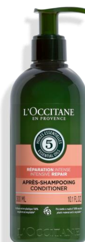
REPAIRING CONDITIONER 300ml

Formulated without silicones, this shampoo gently cleanses, repairs dry hair and strengthens the hair fiber. The blend of five 100% natural essential oils of Angelica, Ylang-Ylang, Sweet Orange, Lavender and Geranium, combined with a repairing complex, makes hair soft and radiant.