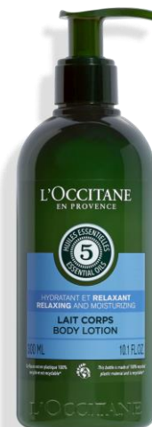
RELAXING BODY LOTION 300ml

The unique combination of five 100% natural essential oils including Sweet Orange, Pine, Rosemary, Mint and Litsea Cubeba, allows this shower gel to gently clean the skin and leave you feeling energized and revitalized.