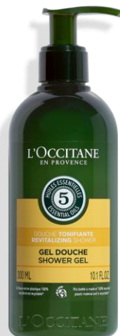
REVITALIZING SHOWER GEL 300ml

100% R-PET Bottles Made of recycled plastic*