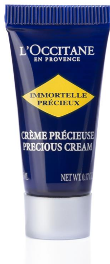
PRECIOUS IMMORTELE FACE CREAM 5ml

Immortelle is a flower that never fades, even when picked. This powerful ingredient fights visible signs of ageing, giving skin the youthful and radiant glow you've always wanted.