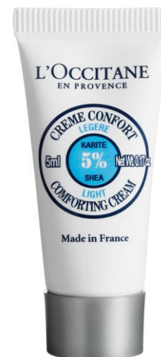
SHEA BUTTER LIGHT FACE CREAM 5ml

An iconic ingredient that works its nourishing magic while taking your senses on a journey.