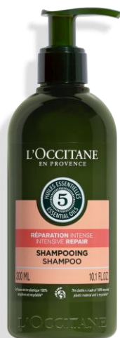
REPAIRING SHAMPOO 300ml

The unique combination of five 100% natural essential oils, including Lavender, Geranium, Ylang-Ylang, Cedara and Sweet Orange, allows this body lotion to help to moisturize and to create a moment of relaxation